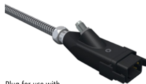
Plug for use with non-hhs systems