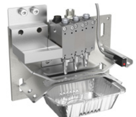
Benchmark in cold glue application PX 1000 multiple head